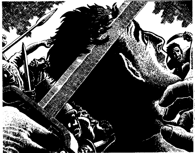
Illustration by Basil Wolverton

Fearful of his father David, Absalom fled with his family and servants to Geshur, in the area of Syria, for about three years. David eventually pardoned Absalom and allowed him to return to Jerusalem (II Samuel 13:38-39; 14:21). Even then, two more years went by before David allowed Absalom to visit