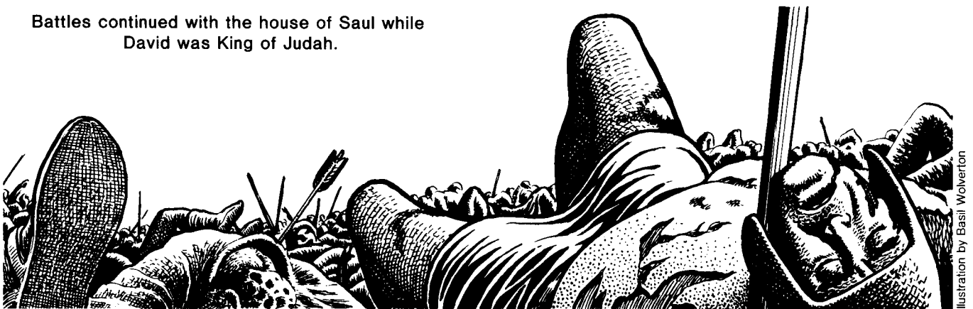
Illustration by Basil Wolverton