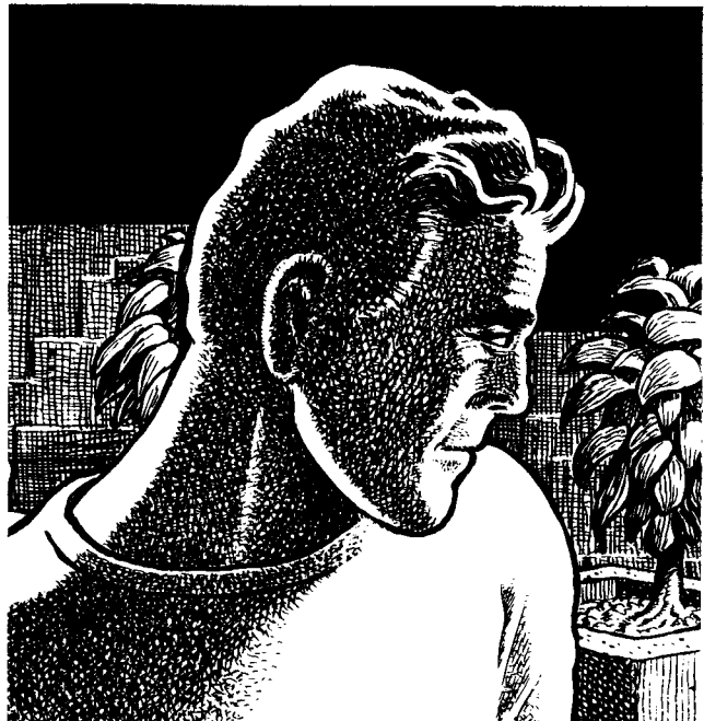
David noticed Bathsheba from his palace roof.

But David's plan failed. Uriah refused to see his wife out of respect for his fellow soldiers on the front. "Why should I go and enjoy myself with my wife while my fellow soldiers are enduring the hardness of battle? I will not go and see her!" (II Samuel 11:11-13.) David suddenly felt trapped. He feared what the people might do if