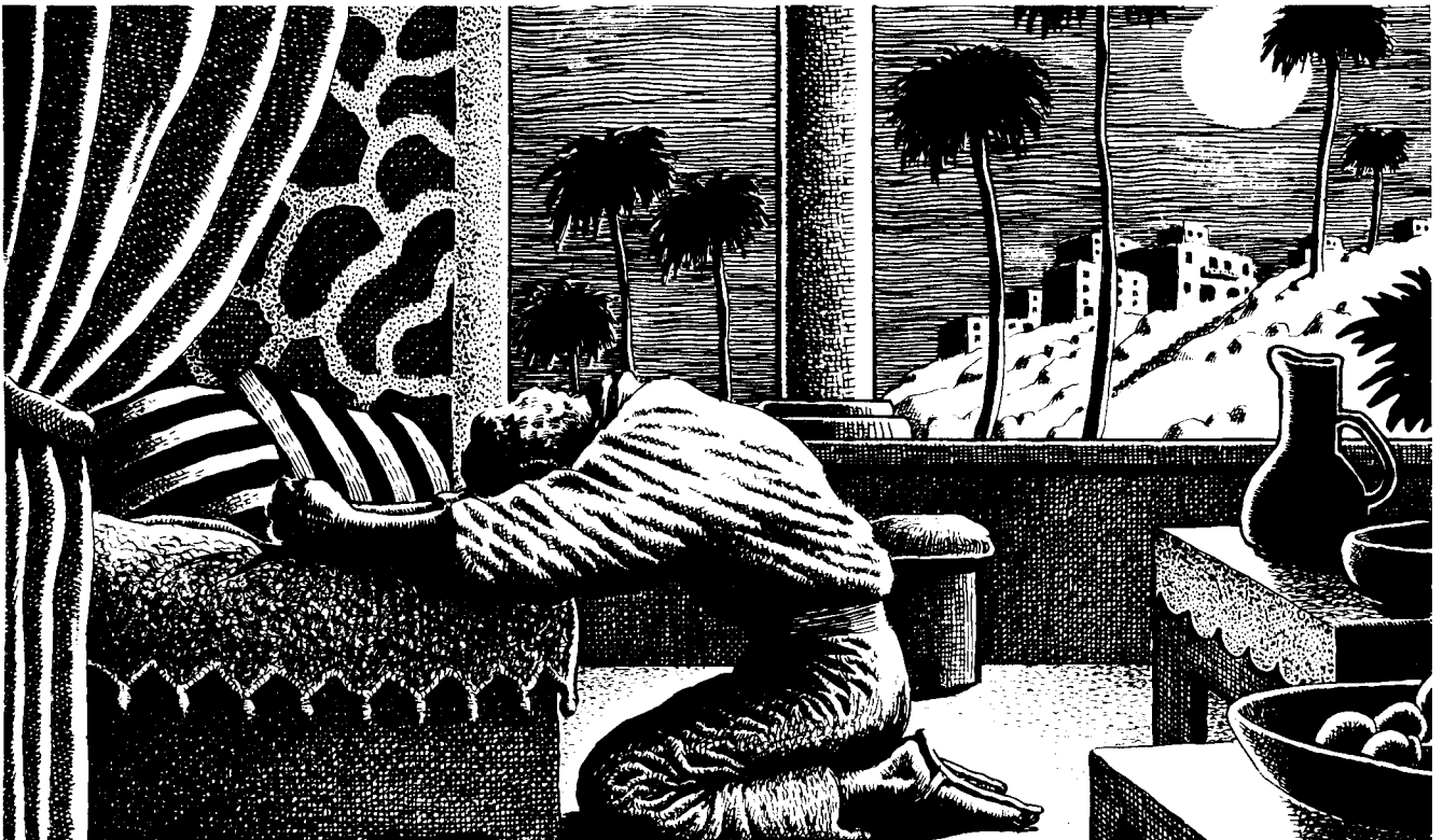
Whenever Samuel needed help, he prayed to God and asked what to do.

So Samuel told them everything. He told them what a king would do: take their sons to fight in his army, their daughters to be his servants and cooks; take their fields and vineyards, their sheep and cattle. Whatever the king wanted, he would take from them (I Sam. 8:11-18).