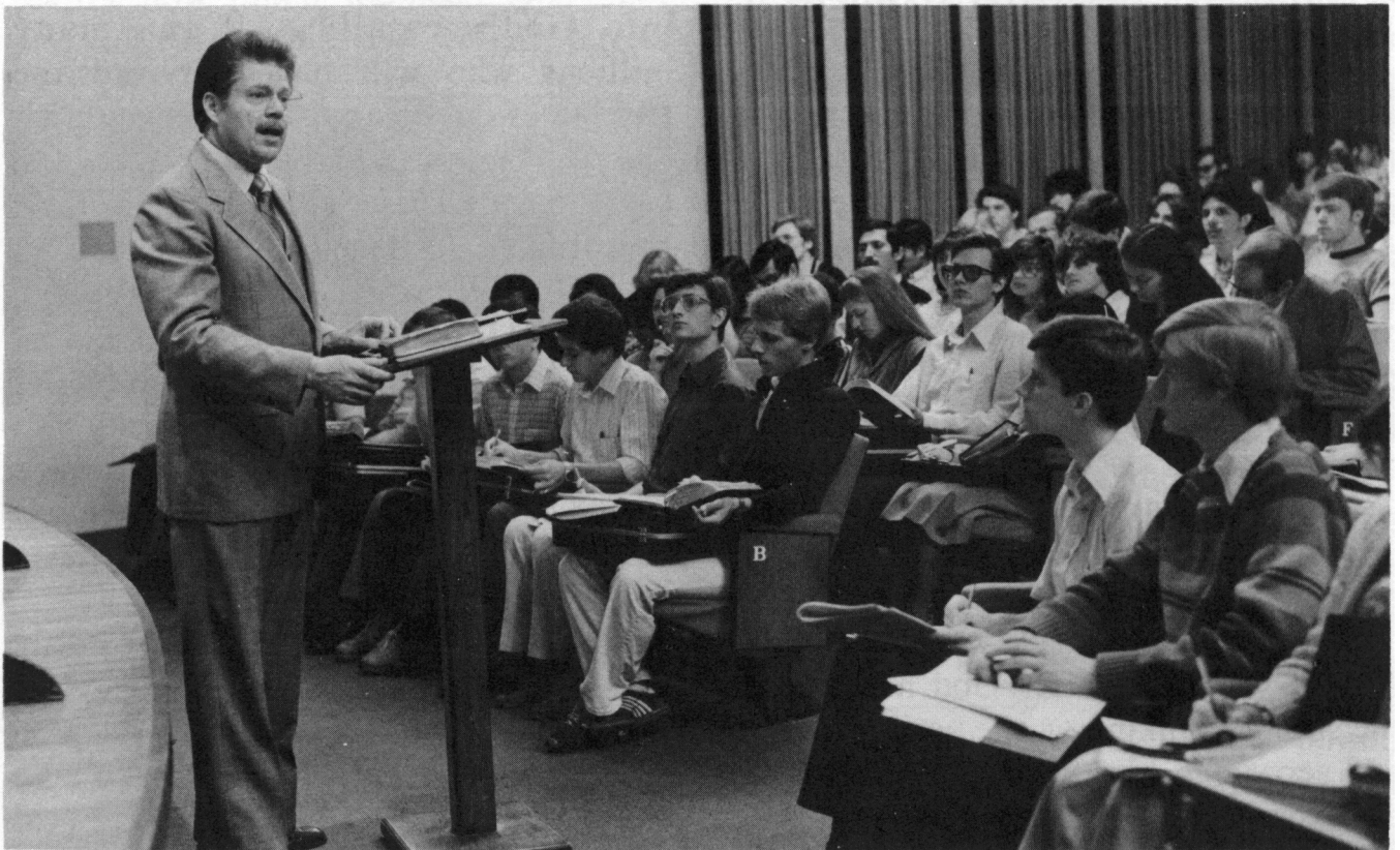
In the World Tomorrow, you will have the wonderful opportunity to be a teacher and teach God’s way of give to the rest of the world.

But up to this point in God’s plan, still only a small fraction of the total number