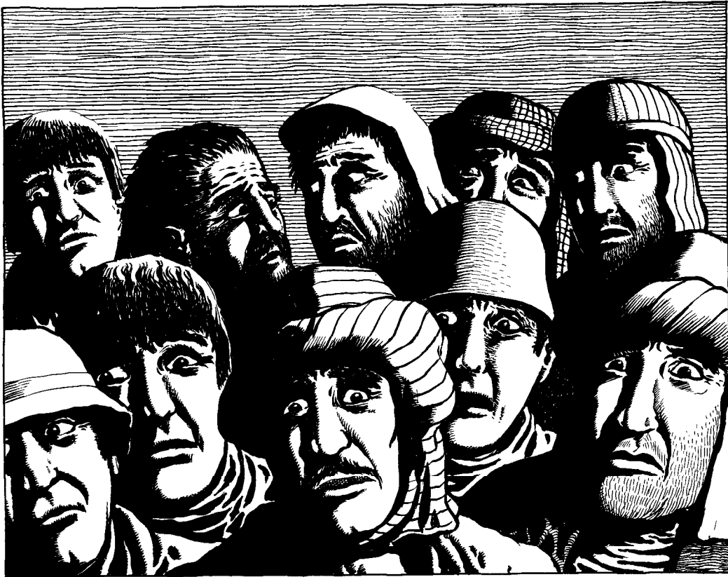
Joseph's ten brothers were filled with fear when they were told that they would be jailed.

"But we are telling the truth!" they called to Joseph as guards roughly led them away to a dungeon. (Verse 17.)