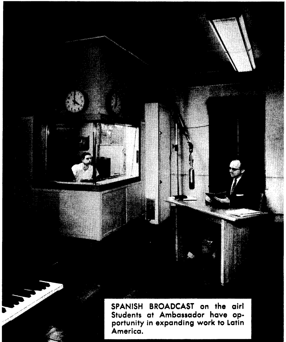
SPANISH BROADCAST on the air! Students at Ambassador have opportunity in expanding work to Latin America.

Perhaps the most important educational advantage at Ambassador is that students are taught the real PURPOSE of human life. This enables them to properly orient themselves in any other subject they may ever study—and to prop-