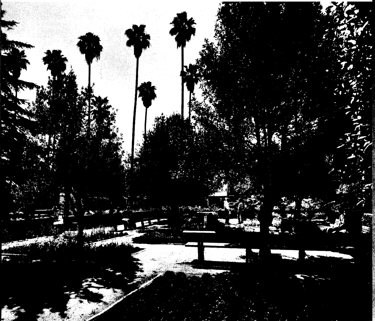
SPACIOUS SUNKEN GARDENS surrounding Manor del Mar, men's student residence. In sunshine of Southern California, students find outside study pleasant and relaxation a delight at Ambassador College.