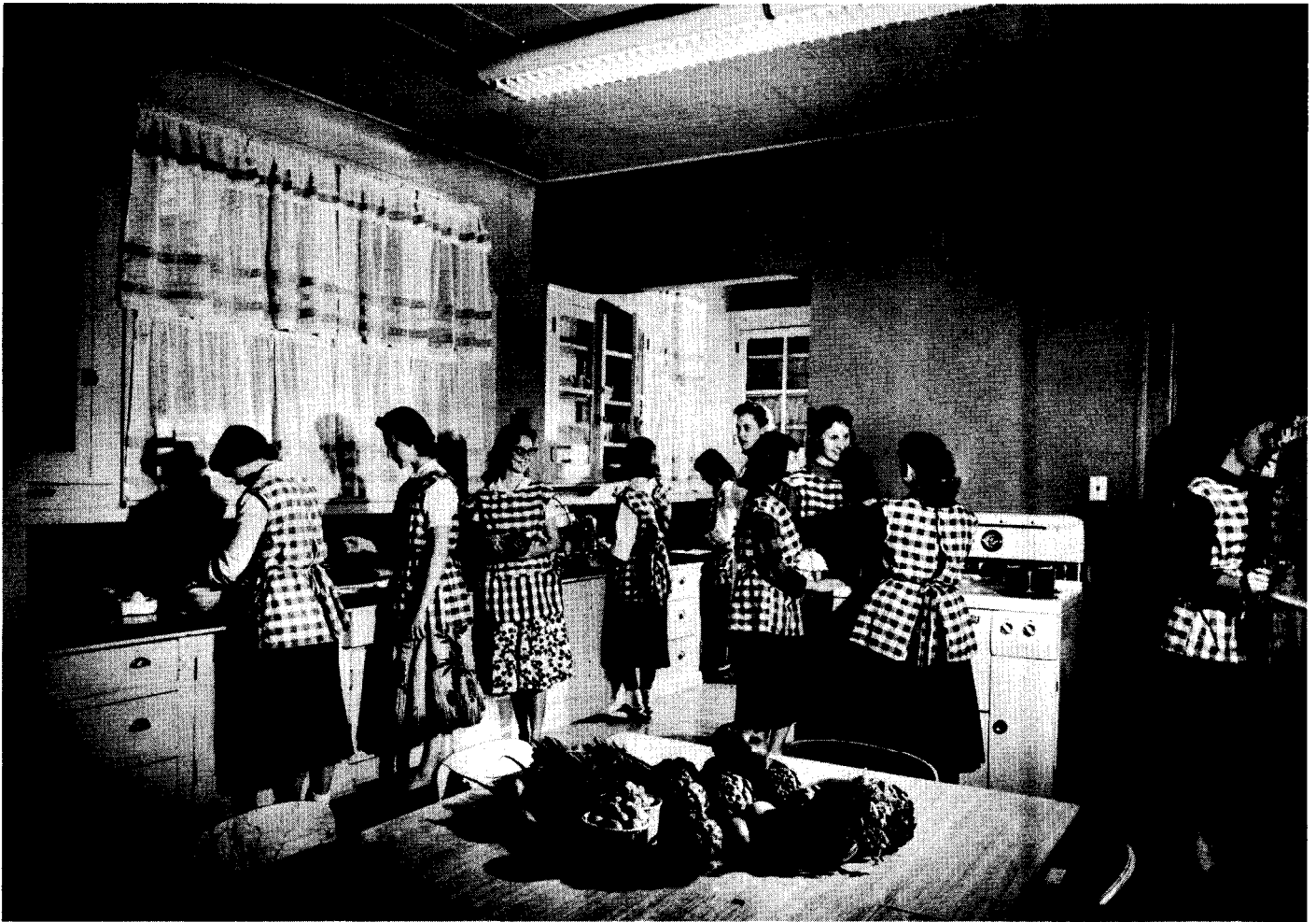
HOME ECONOMICS Department. Young women at Ambassador have splendid opportunity to learn and to apply principles of healthful living.

PERSONALITY — the whole being —as a sharp and effective instrument in the hands of Almighty God the supreme RULER of heaven and earth.