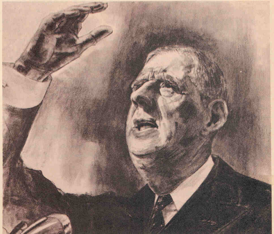
"I Am France!"

"The once world-girdling French empire has pulled one of history's fastest disappearing acts," the New York Journal-American wrote on March 24, 1962. "For most of the first half of this century, the Tricolor flew over sizeable and valuable chunks of all the continents. Its domain was in every sense a close rival of Britain's far-flung