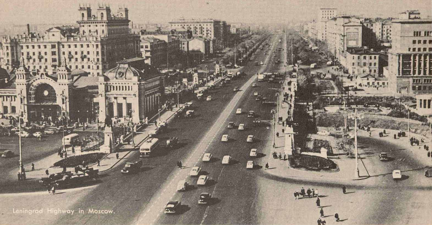
Leningrad Highway in Moscow.