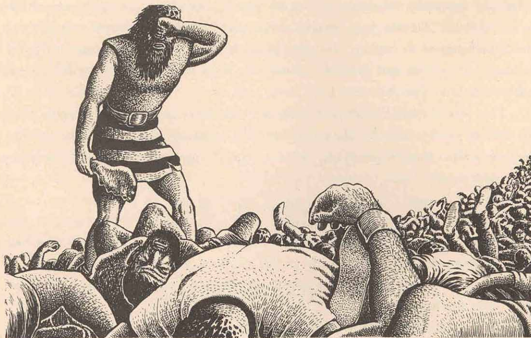
Samson realized that God had helped him overcome the hundreds of soldiers heaped about him.

It was a ragged, sweating, weary Danite who looked warily about for more Philistines to rush in. He was breathing hard after his long, fatiguing struggle. He listened for the approach of more attackers, but the only sounds were the groans