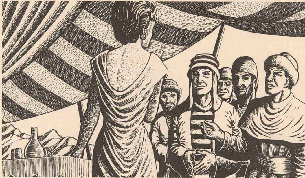
The five rulers of Philistia sent five men to pay her for the secret of Samson's strength.

The agents were a bit taken aback by this statement, but at the same time they were relieved that they wouldn't have so much to explain.